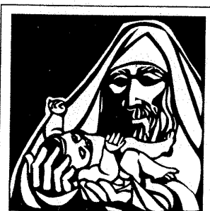
THE PRESENTATION OF THE LORD